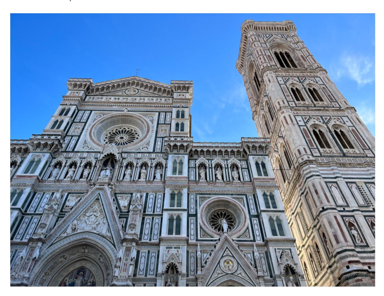
Cathedral Santa Maria del Fiore

To conclude, I'd say that this trip was instructive, definitely enjoyable and memorable. We had the opportunity to meet people we would have otherwise never met, we also had the opportunity to make friends from abroad and among our own group since we didn't all knew each other before. It was wonderful to see monuments and places we had only seen in pictures before. What a wonderful experience!