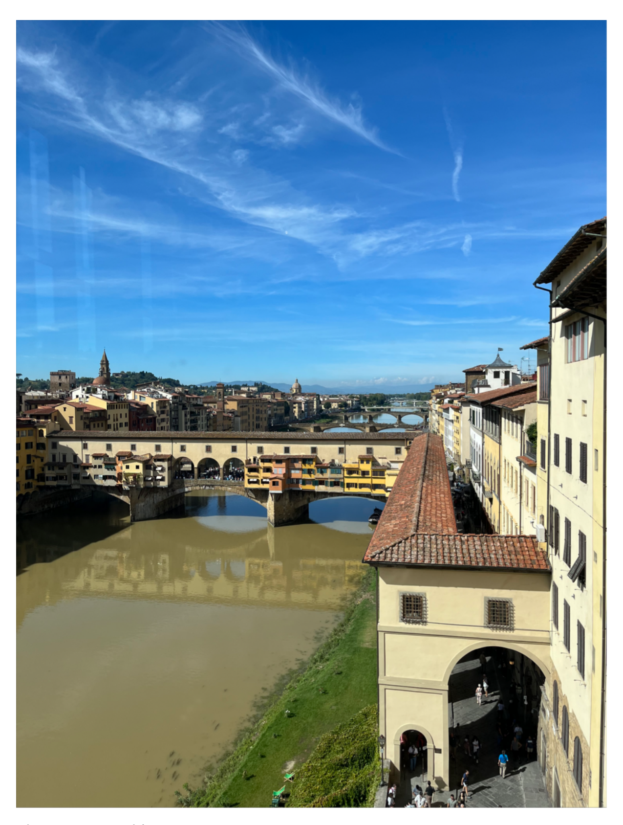
The Ponte Vecchio