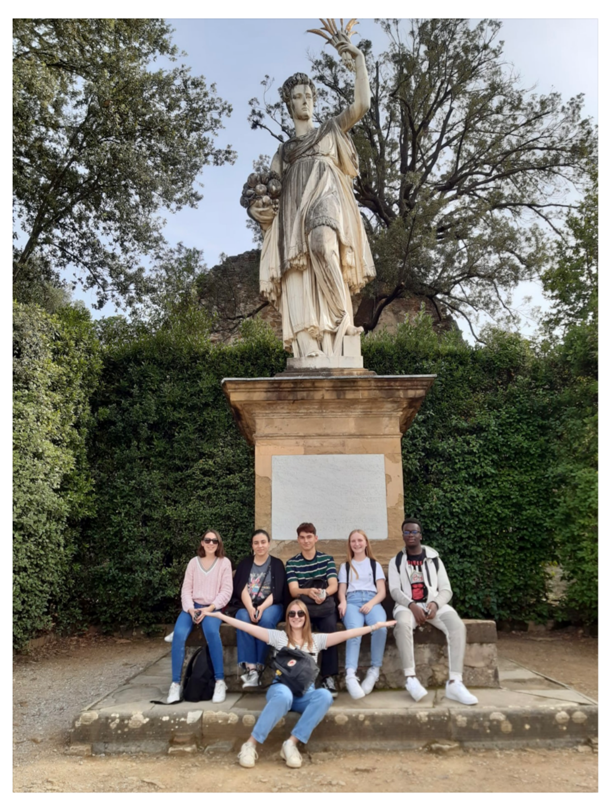
The 6 of us in the Giardino Boboli