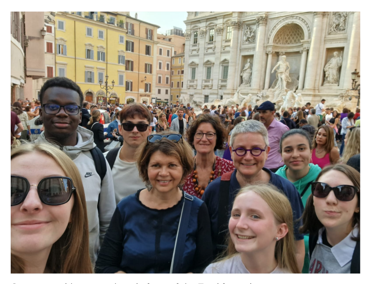
Our group with our teachers in front of the Trevi fountain