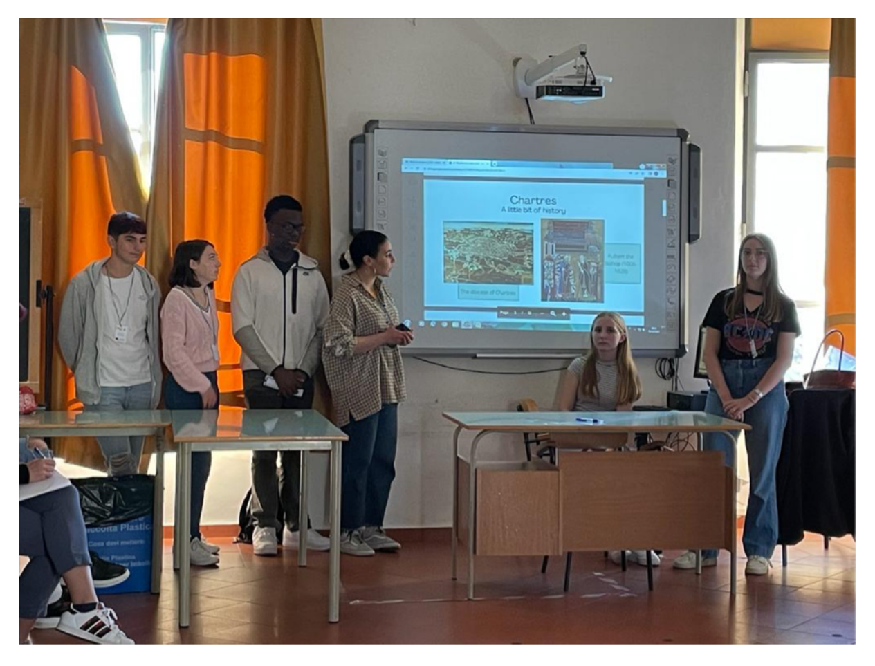
Us during our presentation