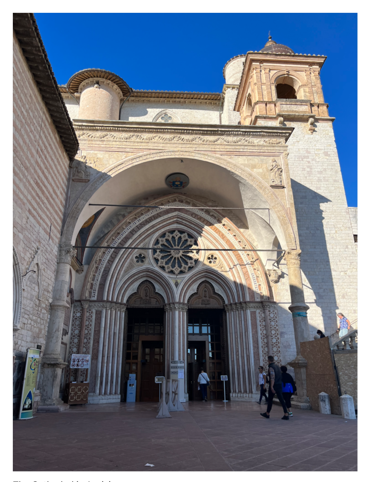
The Cathedral is Assisi